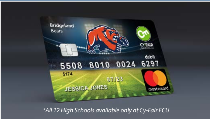
*All 12 High Schools available only at Cy-Fair FCU

In 2018, we continued our support for local High School Booster Clubs with $18,328.08 in funds generated by our School Spirit Debit Cards . With the success of such programs, we are looking to expand our reach to support additional types of High School Booster Clubs. In addition, our School Association & Non-Profit Accounts continued to benefit local PTOs & Boosters by providing a more affordable Checking Account option.